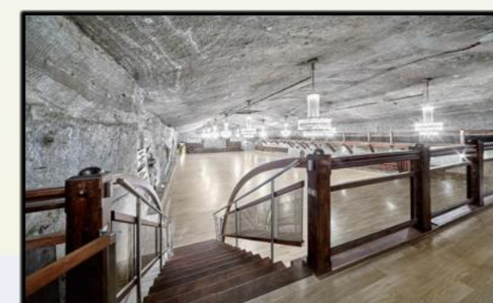
Place for Gala Dinner The "Wieliczka" Salt Mine